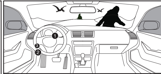
Steering Lock Connector