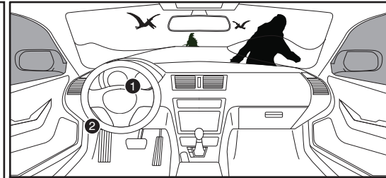
Steering Lock Connector